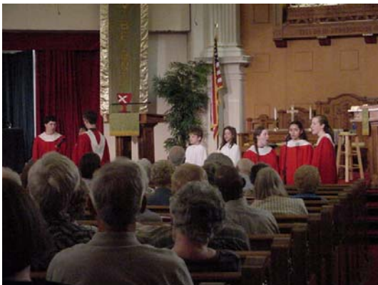
TBA MUSIC FEST